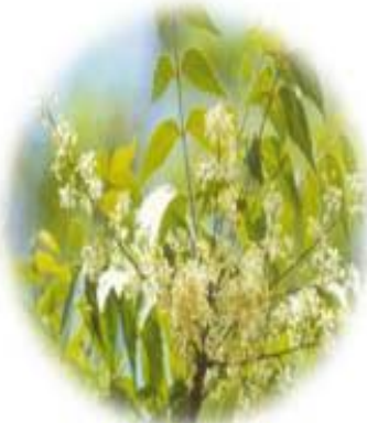
GREEN LEAF MANURES